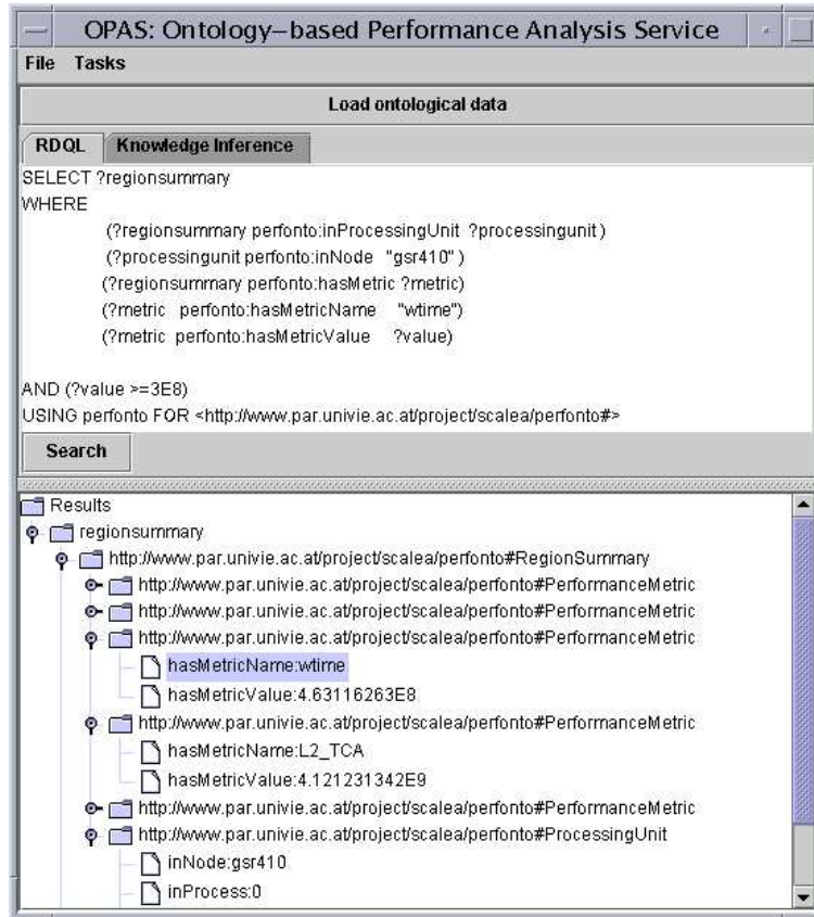
Figure 6: Graphical User Interface for conducting searches.

performance metrics in details. Other information, such as source code and machine, can be visualized as needed.